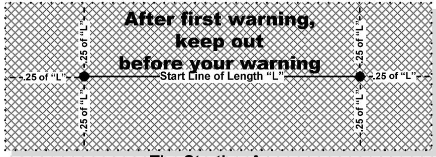
Diagram 1 The Starting Area