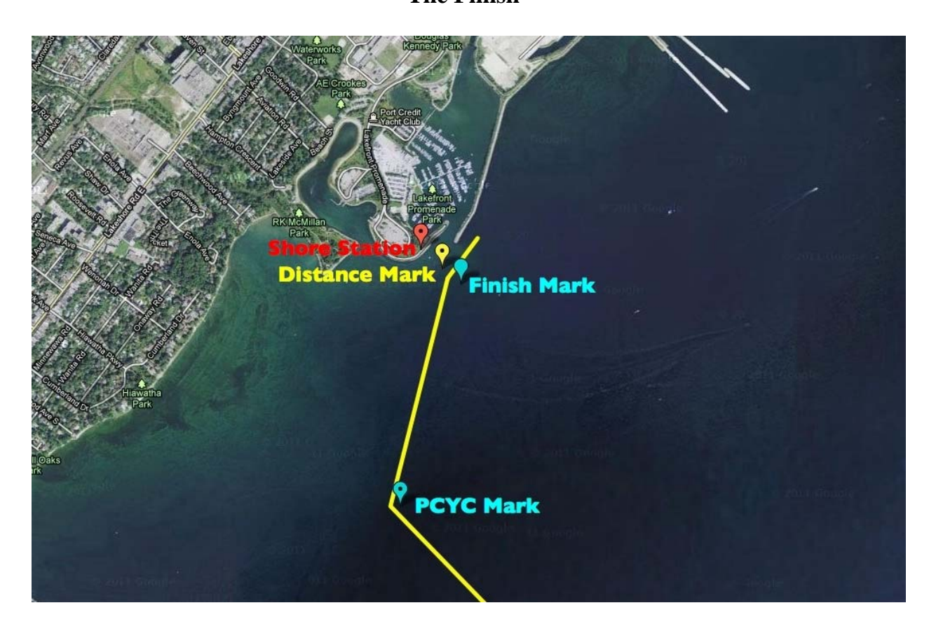
Diagram 2 The Finish

After the first warning signal for a race and prior to her warning signal, a sailboat shall keep clear of the starting area that extends one-quarter of the length of the starting line ahead of and behind the starting line. It shall also extend one-quarter of the length of the starting line past either end of the starting line