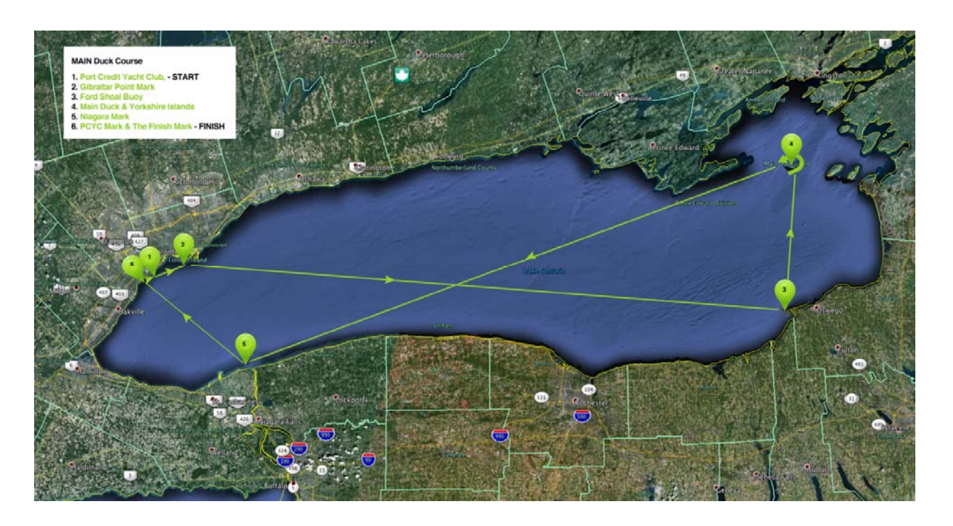
Not be used for navigation